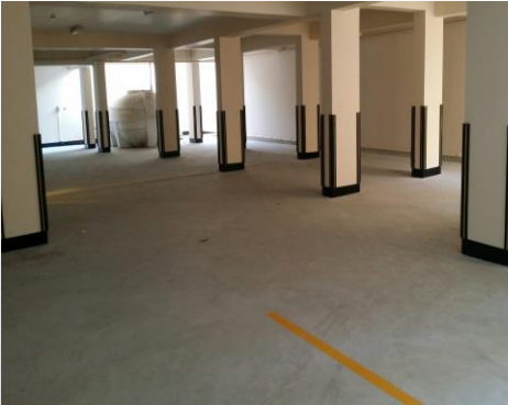
Secure Car Parking

Rent inclusive of electricity & water, tax, internet and free-to-air channels